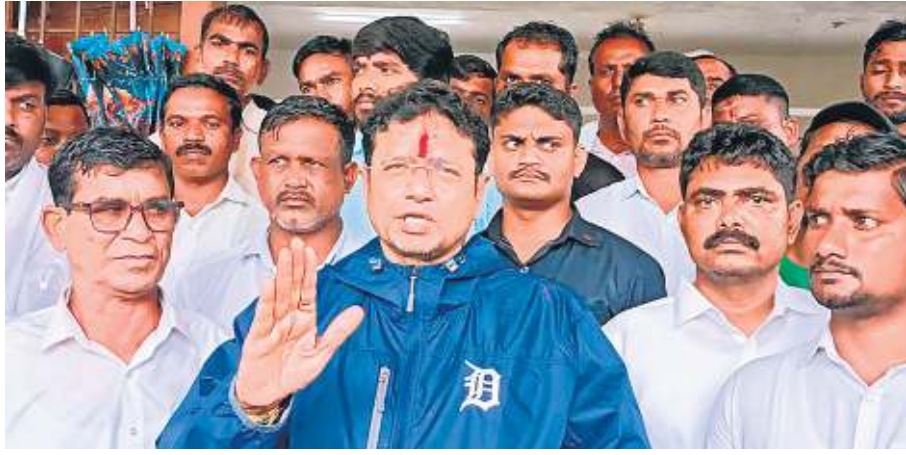
Information Technology Minister D Sridhar Babu speaking to reporters in Peddapalli on Monday

Unprecedented flood relief measures are being implemented in the state by alert-