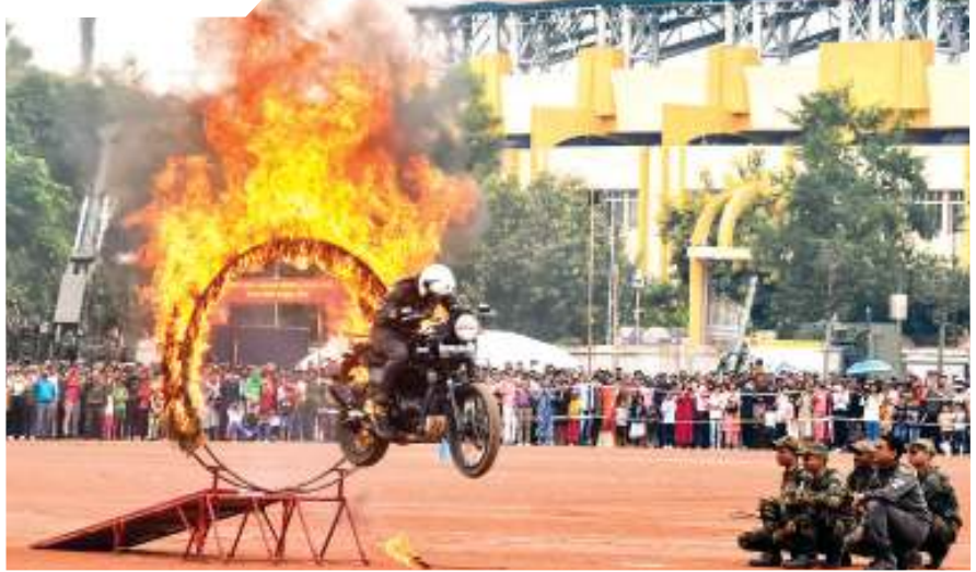
Army jawans perform stunts during the closing ceremony of 'Know Your Army' programme in Ranchi