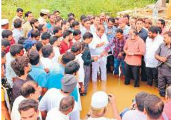
Health Minister Damodara Raja Narasimha interacting with people in flood-hit areas in Sangareddy on Monday

He assured the people that an open drain would be linked to Chandraiah Kunta, the local pond. The Minister told the people in the flood-affected areas not to get disheartened. The State government would support them and ensure that