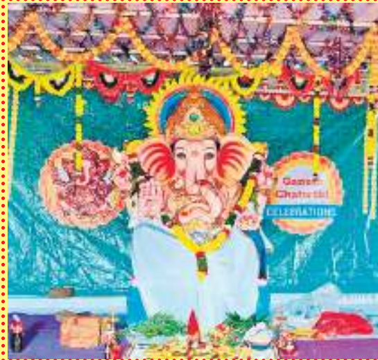
A decorated Ganesha pandal in an apartment in Pragathi Nagar