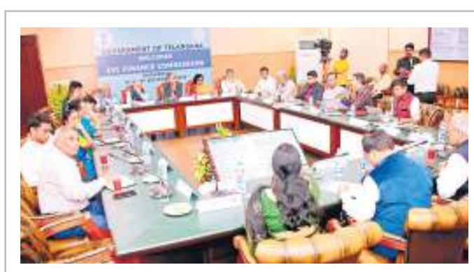
Representatives of political parties, local bodies and trade organisations submitted their inputs to the 16th Finance Commission led by Aravind Panagariya, urging increased devolution of funds to Telangana and highlighting the infrastructure needs of the state at a meeting held at the Praja Bhavan on Monday.