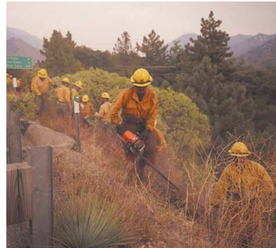
Firefighters work against the advancing Line Fire in Mentone, Calif. on Sunday.

AP ■ LONDON Afghanistan's embassy in London is being shut down after it was disowned by the country's Taliban rulers, the UK government said Monday. The Foreign Office said the embassy is being closed following the dismissal of its staff by the Taliban. Britain does not recognise the Taliban government. Ambassador Zalmay Rassoul wrote on the social network X that the embassy would shut its doors on Sept. 27 "at the official request of the host country." Neither the UK government nor the ambassador said what would happen during the embassy's staff. Diplomats who served under Afghanistan's former Western-backed government were left in limbo when the Taliban seized Kabul and returned to power in August 2021. Many embassies in Europe and beyond have continued to operate, but have been accused by Kabul of failing to cooperate with the government. Afghanistan has sent Taliban-approved diplomats to some countries, including Pakistan and China.