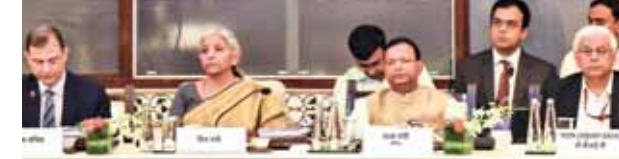
Union Finance Minister Nirmala Sitharaman with MoS Pankaj Chaudhary and others during the 54th meeting of the GST Council, in New Delhi.

Union Finance Minister Nirmala Sitharaman on Monday said the GST Council has decided to reduce the rates on some cancer drugs to five percent from 12 percent. The Council also reduced the rate on namkeen to 12 per cent from 18 per cent, she said, adding that the Council will take a call on reduction in rate on health insurance at the next meeting in November. Sitharaman, who chaired the 54th meeting of the GST