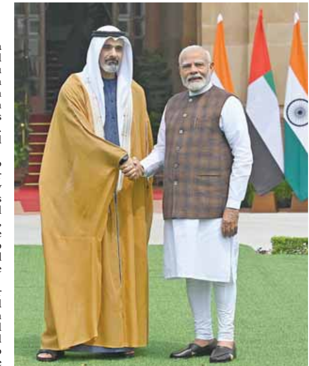
Prime Minister Narendra Modi meets Abu Dhabi's Crown Prince Sheikh Khaled bin Mohamed bin Zayed Al Nahyan at the Hyderabad House, in New Delhi, Monday.