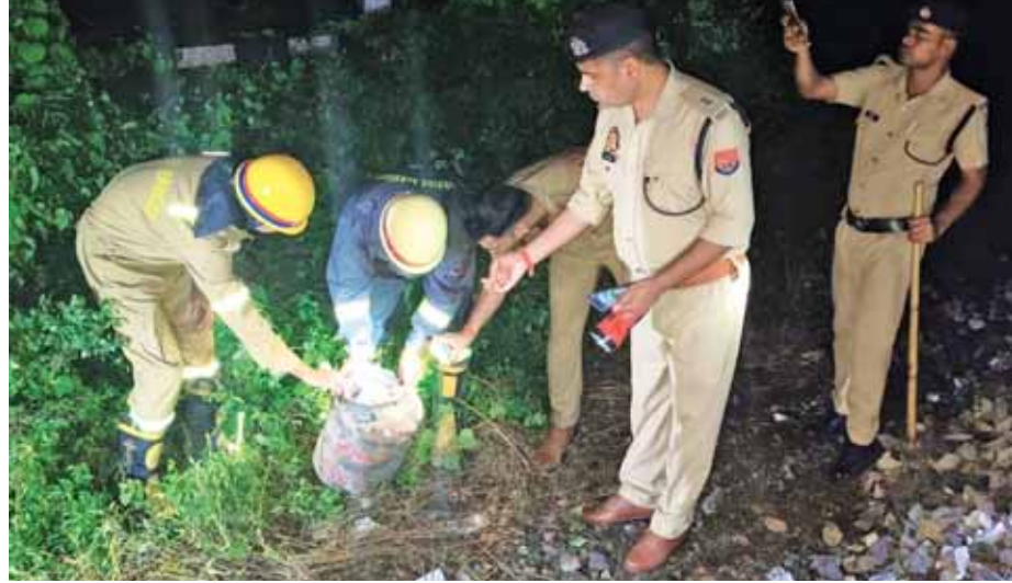
Police and fire services personnel inspect an LPG cylinder after an attempt was allegedly made to derail the Kalindi Express, heading towards Bhiwani from Prayagraj, by placing the LPG cylinder on the tracks, in the Shivrajpur area in Kanpur, on Sunday night, September 8, 2024. Due to being hit by the train, the cylinder was thrown away from the tracks, according to officials.

For the second consecutive day yet another major train accident was averted as the Bhiwani-Prayagraj Kalindi Express was brought to a screeching halt after hitting an LPG cylinder placed on the tracks. In what appears to be a sabotage, a bottle of petrol and matchboxes were also recovered from the site. Police said the incident occurred around 8.20 pm on Sunday when the train was running at a high speed.