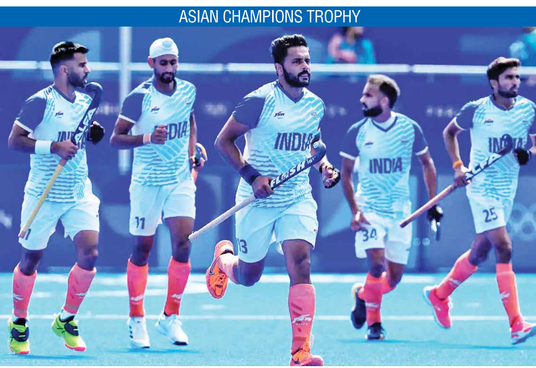
ASIAN CHAMPIONS TROPHY