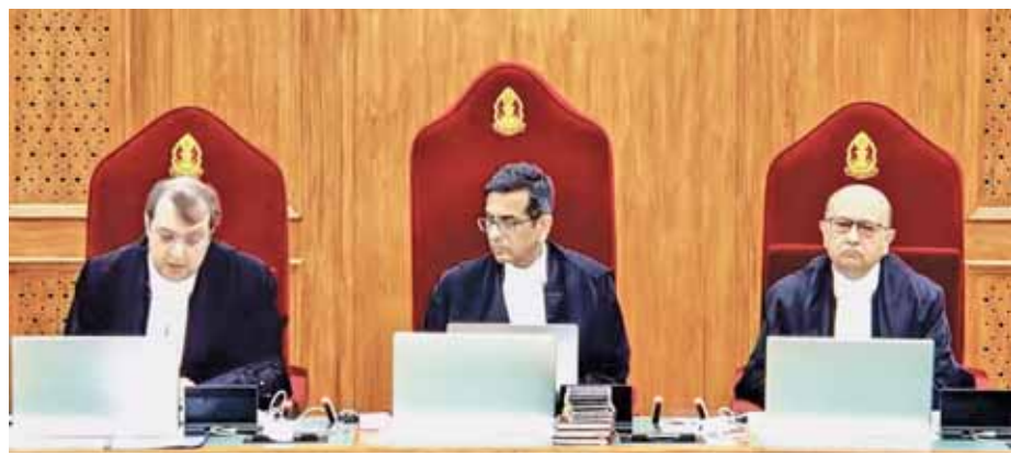
A bench comprising Chief Justice of India (CJI) D.Y. Chandrachud, Justice J.B. Pardiwala and Justice Manoj Misra during the second day of hearing on a suo moto case related to the alleged sexual assault and murder of a postgraduate trainee doctor in Kolkata, at the Supreme Court in New Delhi, Monday, September 9, 2024.

PTI ■ NEW DELHI Protest cannot be at the cost of duty," the Supreme Court observed on Monday as it directed the West Bengal doctors protesting over the rape and killing of a postgraduate medic at the State-run RG Kar Medical College and Hospital in Kolkata to return to work immediately. A bench headed by Chief Justice DY Chandrachud directed the protesting doctors to get back to work by 5 pm on Tuesday and assured them that there will be no adverse action if they resume duty. "The State of West Bengal must take steps to create confidence in the minds of the doctors that their concerns regarding their safety and security are being duly attended to. In order to ensure this, all the district collectors and SPs (superintendents of police) shall take stock of the situation in all Government medical colleges and public hospitals and provide adequate safety. "We also direct that in the event the doctors return to duty on or before 5 pm (on Tuesday), no adverse disciplinary action should be taken against them. If there is continued abstention of work, there may be a likelihood of