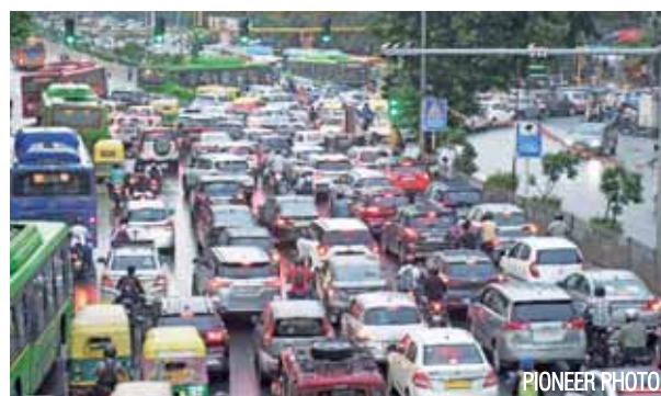
lot easier than giving Central Delhi a traffic heart attack whenever any foreign or domestic dignitary wants to pay their respects to Gandhi."

bin Mohamed bin Zayed Al Nahyan visited Raj Ghat, the memorial dedicated to Mahatma Gandhi, and laid a wreath there. He also became the third generation of the ruling family of the United Arab Emirates (UAE) to plant a sapling at the site. The security arrangements in view of the visit irked commuters who expressed their anguish over the traffic situation in the city. An X user expressed his anguish over the traffic jam in the city and said, "Just build a Helipad at Rajghat; will be a