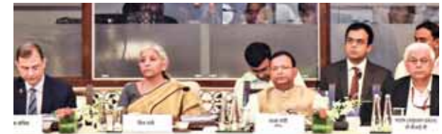
Union Finance Minister Nirmala Sitharaman with MoS Pankaj Chaudhary and others during the 54th meeting of the GST Council, in New Delhi

Union Finance Minister Nirmala Sitharaman on Monday said the GST Council has decided to reduce the rates on some cancer drugs to five percent from 12 percent. The Council also reduced the rate on namkeen to 12 per cent from 18 per cent, she said, adding that the Council will take a call on reduction in rate on health insurance at the next meeting in November. Sitharaman, who chaired the 54th meeting of the GST