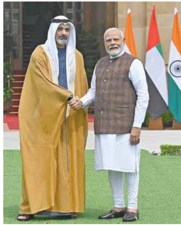
Prime Minister Narendra Modi meets Abu Dhabi's Crown Prince Sheikh Khaled bin Mohamed bin Zayed Al Nahyan at the Hyderabad House, in New Delhi, Monday

After holding talks with Modi, the visiting leader paid tributes to Mahatma Gandhi at his memorial Rajghat. An Agreement for long-term LNG supply between Abu Dhabi National Oil Company (ADNOC) and Indian Oil Corporation Ltd and another agreement for Abu Dhabi onshore block-one between Strategic Petroleum Reserve Ltd (ISPRL) are among the