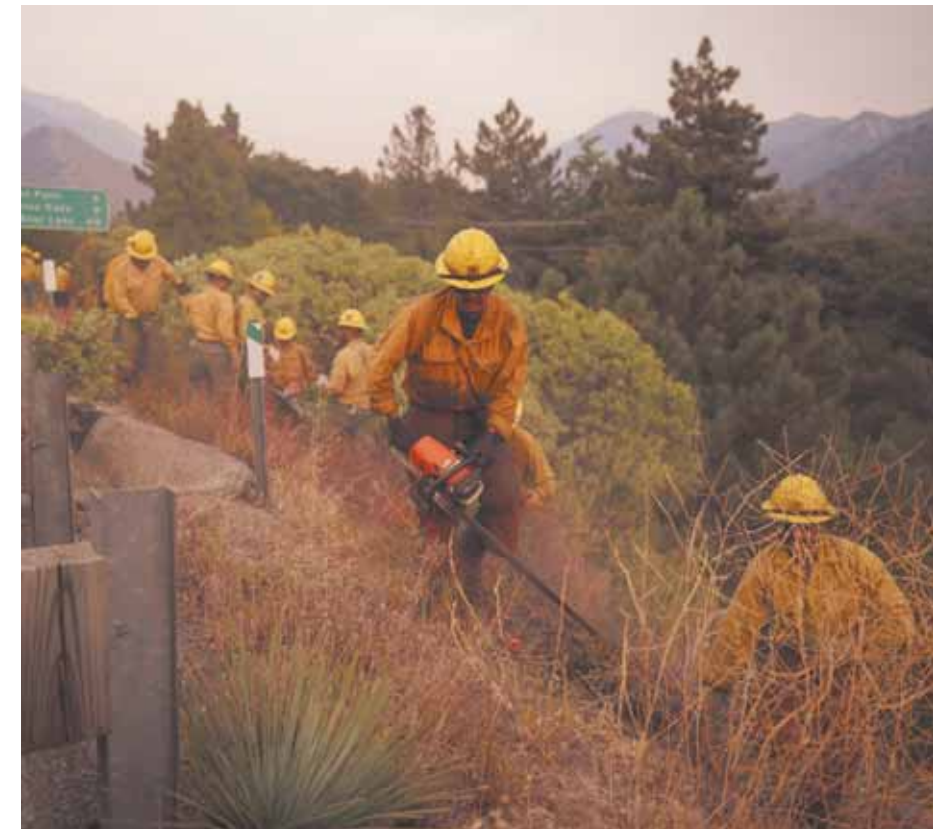
Firefighters work against the advancing Line Fire in Mentone, Calif. on Sunday.