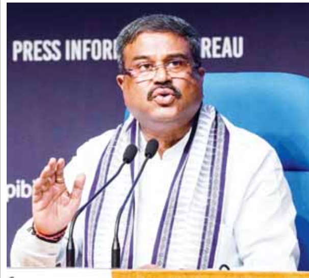
PIONEER NEWS SERVICE ■ NEW DELHI

Education Minister Dharmendra Pradhan on Monday accused Tamil Nadu Chief Minister M K Stalin of trying to pit States against each other to make a point about non-implementation of the new National Education Policy (NEP). Pradhan made the comments in response to Stalin's statement alleging that the