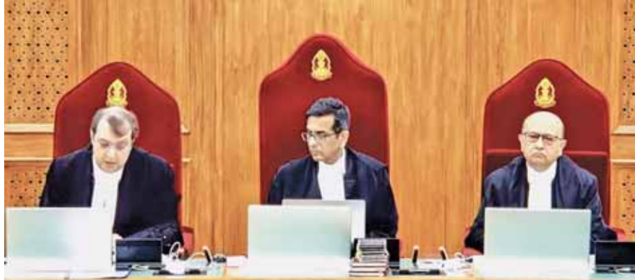
A bench comprising Chief Justice of India (CJI) D.Y. Chandrachud, Justice J.B. Pardiwala and Justice Manoj Misra during the second day of hearing on a suo moto case related to the alleged sexual assault and murder of a postgraduate trainee doctor in Kolkata, at the Supreme Court in New Delhi, Monday, September 9, 2024

Protest cannot be at the cost of duty," the Supreme Court observed on Monday as it directed the West Bengal doctors protesting over the rape and killing of a postgraduate medic at the State-run RG Kar Medical College and Hospital in Kolkata to return to work immediately.