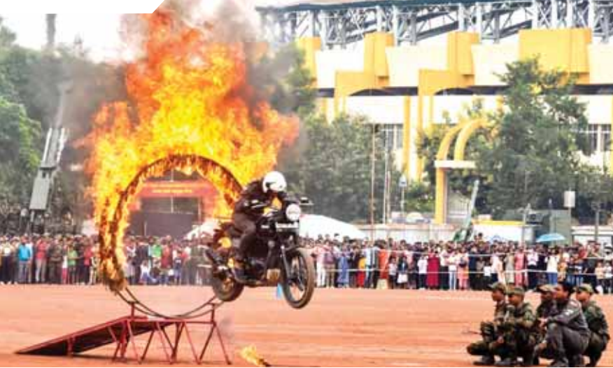
Army jawans perform stunts during the closing ceremony of 'Know Your Army' programme in Ranchi