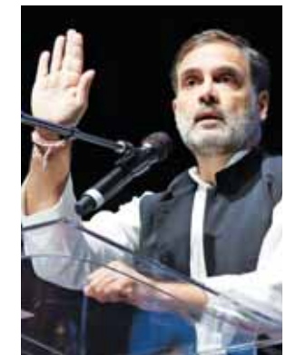
LoP in Lok Sabha and Congress MP Rahul Gandhi addresses the Indian Diaspora, at Dallas in Texas, USA

"Everybody knows that Rahul Gandhi is an immature and part-time leader. But People have put a huge responsibility on his shoulders since he became the leader of opposition (in the Lok Sabha). But I feel sad to say that Rahul Gandhi is a black spot in Indian democracy. He does not even know what to talk about when he visits a foreign country," said Gaurav Bhatia, BJP's national spokesperson, at a Press conference at the BJP