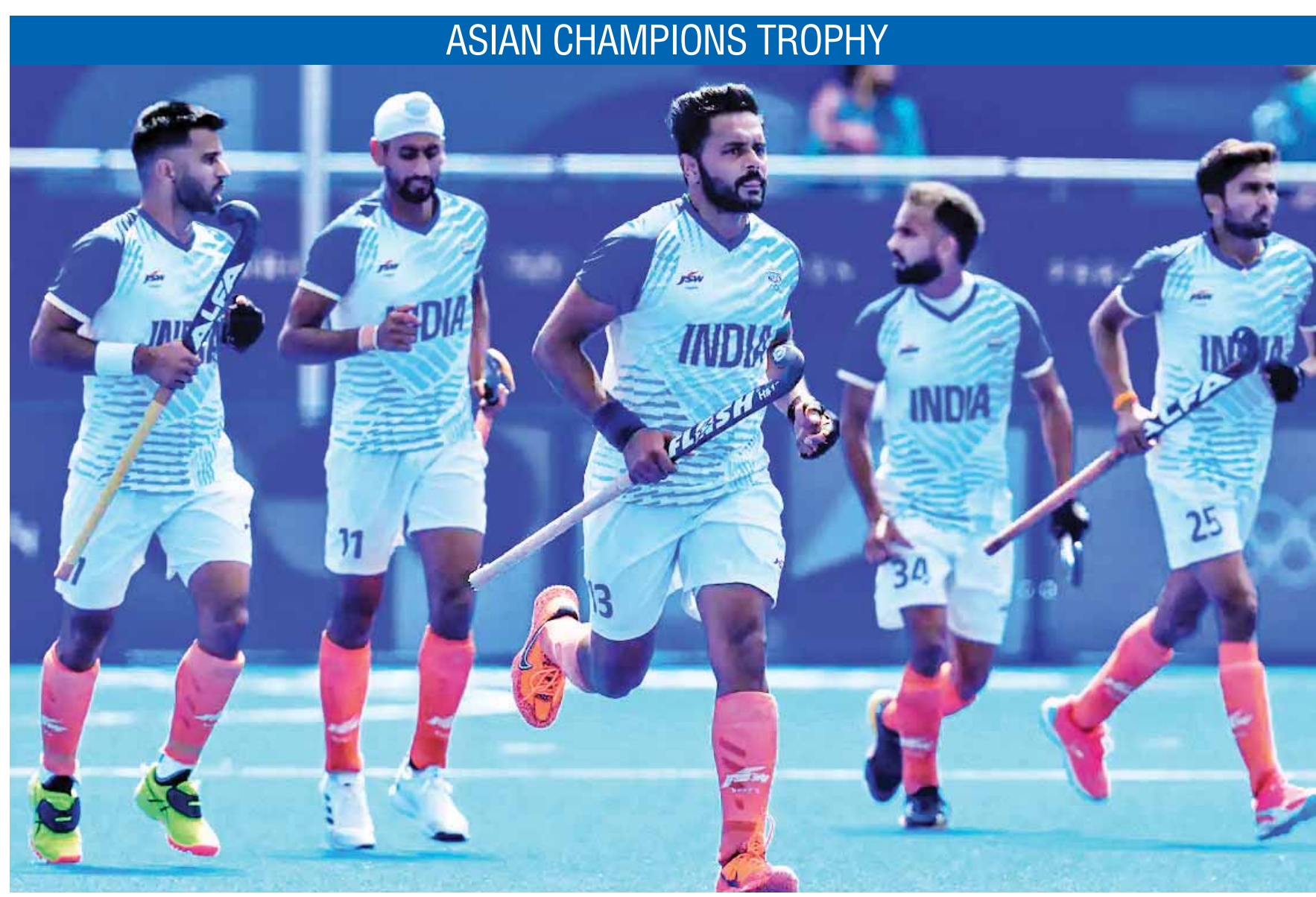
ASIAN CHAMPIONS TROPHY