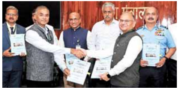
The Ministry of Defence signed a contract with Hindustan Aeronautics Limited for 240 AL-31FP Aero Engines for Su-30MKI aircraft in the presence of the Defence Secretary Giridhar Aramane and the Chief of the Air Staff Air Chief Marshal VR Chaudhari, in New Delhi on September 9, 2024

According to AAP insiders, the alliance seemed nearly sealed on Saturday and the delay from Congress in final confirmation led to an impasse, irking the AAP which had threatened to release the names of all 90 candidates if no final word is received from the grand old party till Monday evening.