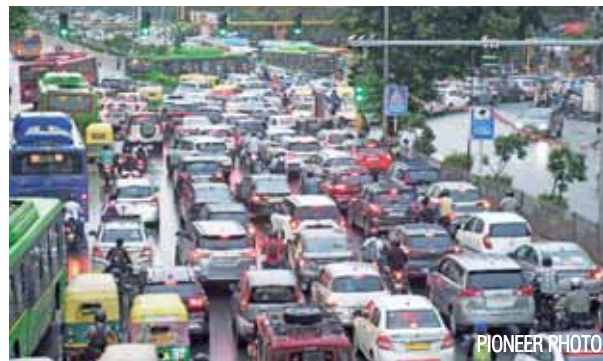
lot easier than giving Central Delhi a traffic heart attack whenever any foreign or domestic dignitary wants to pay their respects to Gandhi."

bin Mohamed bin Zayed Al Nahyan visited Raj Ghat, the memorial dedicated to Mahatma Gandhi, and laid a wreath there. He also became the third generation of the ruling family of the United Arab Emirates (UAE) to plant a sapling at the site. The security arrangements in view of the visit irked commuters who expressed their anguish over the traffic situation in the city. An X user expressed his anguish over the traffic jam in the city and said, "Just build a Helipad at Rajghat; will be a