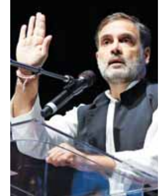
LoP in Lok Sabha and Congress MP Rahul Gandhi addresses the Indian Diaspora, at Dallas in Texas, USA

BJP on Monday launched a scathing attack on Congress leader Rahul Gandhi over his latest remarks in the United States, calling him a "black spot" in Indian democracy. The party accused Rahul Gandhi of trying to weaken Indian democracy with his remarks whenever he is abroad, in accordance with a Memorandum of Understanding (MoU) reportedly signed between the Congress and the Chinese Communist Party during the UPA rule. BJP claimed that Congress had signed a "party-to-party MoU with China" during its rule. "The series of efforts that Rahul Gandhi has been making to weaken Indian democracy is the outcome of that MoU. If I am wrong, I dare Rahul Gandhi and (Congress president) Mallikarjun Kharge to make the MoU public," the party stated in its first reactions to the Rahul's recent visit abroad. "Everybody knows that Rahul Gandhi is an immature and part-time leader. But People have put a huge responsibility on his shoulders since he became the leader of opposition (in the Lok Sabha). But I feel sad to say that Rahul Gandhi is a black spot in Indian democracy. He does not even know what to talk about when he visits a foreign country," said Gaurav Bhatia, BJP's national spokesperson, at a Press conference at the BJP