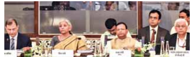
Union Finance Minister Nirmala Sitharaman with MoS Pankaj Chaudhary and others during the 54th meeting of the GST Council, in New Delhi

Union Finance Minister Nirmala Sitharaman on Monday said the GST Council has decided to reduce the rates on some cancer drugs to five percent from 12 percent. The Council also reduced the rate on namkeen to 12 per cent from 18 per cent, she said, adding that the Council will take a call on reduction in rate on health insurance at the next meeting in November. Sitharaman, who chaired the 54th meeting of the GST