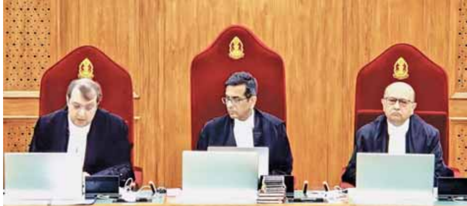
A bench comprising Chief Justice of India (CJI) D.Y. Chandrachud, Justice J.B. Pardiwala and Justice Manoj Misra during the second day of hearing on a suo moto case related to the alleged sexual assault and murder of a postgraduate trainee doctor in Kolkata, at the Supreme Court in New Delhi, Monday, September 9, 2024

Protest cannot be at the cost of duty," the Supreme Court observed on Monday as it directed the West Bengal doctors protesting over the rape and killing of a postgraduate medic at the State-run RG Kar Medical College and Hospital in Kolkata to return to work immediately. A bench headed by Chief Justice D.Y. Chandrachud directed the protesting doctors to get back to work by 5 pm on Tuesday and assured them that there will be no adverse action if they resume duty. "The State of West Bengal must take steps to create confidence in the minds of the doctors that their concerns regarding their safety and security are being duly attended to. In order to ensure this, all the district collectors and SPs (superintendents of police) shall take stock of the situation in all Government medical colleges and public hospitals and provide adequate safety. "We also direct that in the event the doctors return to duty on or before 5 pm (on Tuesday), no adverse disciplinary action should be taken against them. If there is continued abstention of work, there may be a likelihood of