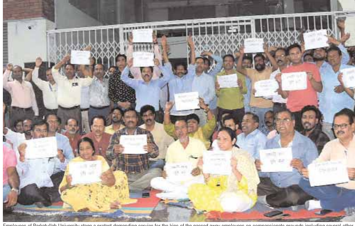
Employees of Barkatullah University stage a protest demanding service for the kins of the passed away employees on compassionate grounds including several other demands, in Bhopal on Monday.