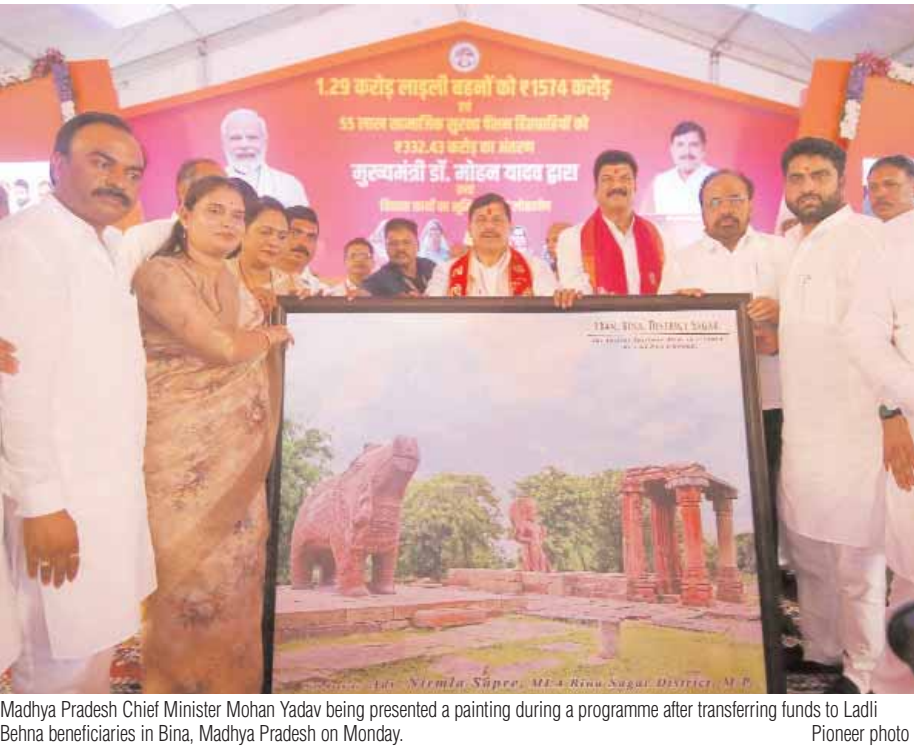
Madhya Pradesh Chief Minister Mohan Yadav being presented a painting during a programme after transferring funds to Ladli Behna beneficiaries in Bina, Madhya Pradesh on Monday.

interest of the state. Regional Industry Conclave is also being held in Sagar this month. Sagar will not lag behind Indore and Bhopal in development. Important steps by the MP government for public welfare Chief Minister Yadav, while discussing the important steps taken by the state government for public welfare, said that arrangements have been made to send critical patients of the state by air to big cities for treatment. Along with this, the Madhya Pradesh government is taking big steps like bringing air cargo. With this, business can be done all over the world. For the conservation of gauvansh, the government is determined to build cowsheds and give bonuses for rearing more than ten cows and also for milk production. Chief Minister Dr. Yadav said that the Ladli Behna Yojana will never be withdrawn.