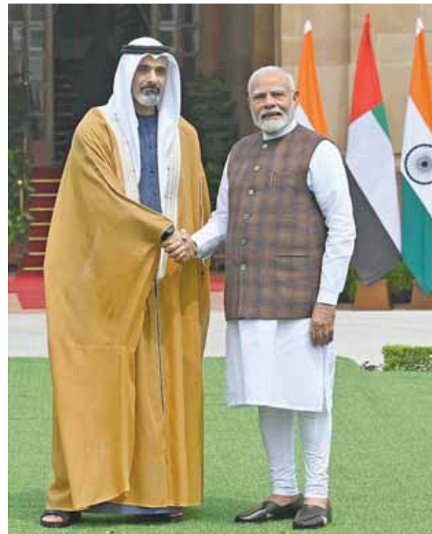
Prime Minister Narendra Modi meets Abu Dhabi's Crown Prince Sheikh Khaled bin Mohamed bin Zayed Al Nahyan at the Hyderabad House, in New Delhi, Monday