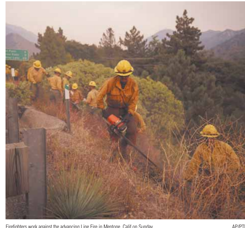
Firefighters work against the advancing Line Fire in Mentone, Calif. on Sunday.

Afghanistan's embassy in London is being shut down after it was disowned by the country's Taliban rulers, the UK government said Monday. The Foreign Office said the embassy is being closed following the dismissal of its staff by the Taliban. Britain does not recognise the Taliban government. Ambassador Zalmay Rassoul wrote on the social network X that the embassy would shut its doors on Sept. 27 "at the official request of the host country." Neither the UK government nor the ambassador said what would happen after the embassy's staff. Diplomats who served under Afghanistan's former Western-backed government were left in limbo when the Taliban seized Kabul and returned to power in August 2021. Many embassies in Europe and beyond have continued to operate, but have been accused by Kabul of failing to cooperate with the government. Afghanistan has sent Taliban-approved diplomats to some countries, including Pakistan and China.