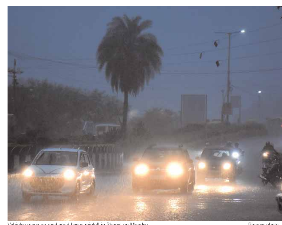
Vehicles move on road amid heavy rainfall in Bhopal on Monday.

Water has increased in Bansagar, Kundalia, Bargi, Indira Sagar, Omkareshwar, Johila, Parasdoh, Chandaura, Kundalia along with Tawa Dam of Narmadapuram. Due to heavy rains for the next 4 days, the gates of many dams will open again.