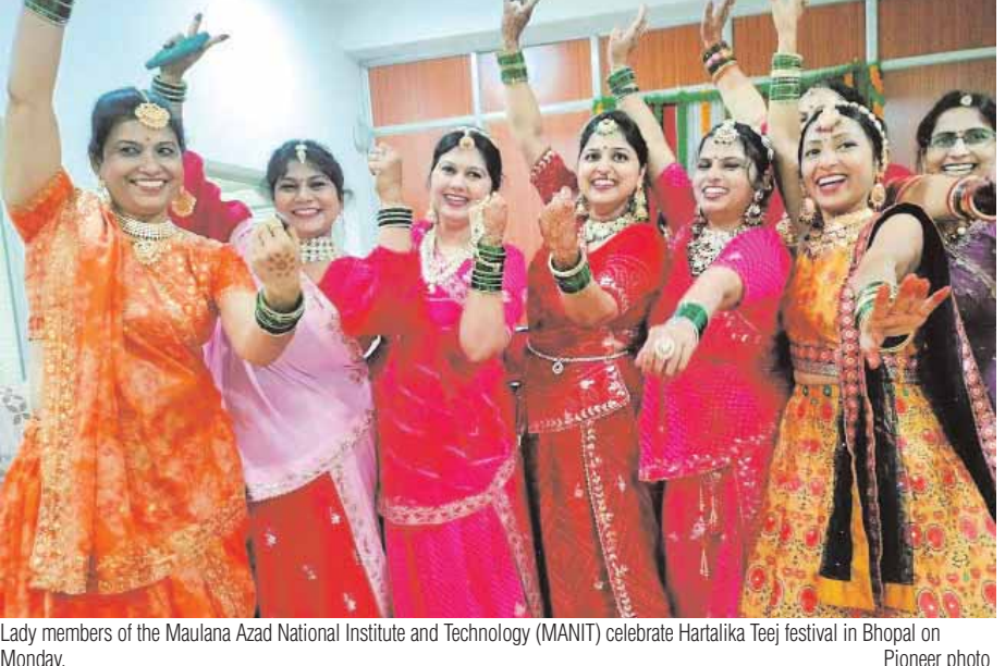
Lady members of the Maulana Azad National Institute and Technology (MANIT) celebrate Hartalika Teej festival in Bhopal on Monday.