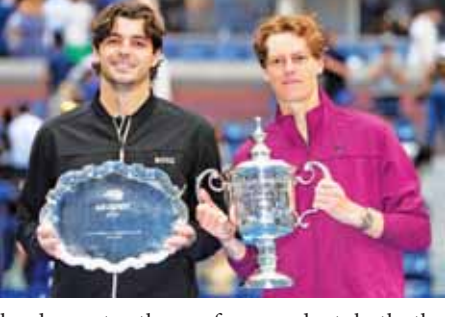
hard courts, the surface used at both the Australian Open and US Open. He's the first man since Guillermo Vilas in 1977 to win his first two Grand Slam trophies in the same season. "So many big wins for me this season," said Sinner, who took full advantage of Week 1 exits by Novak Djokovic and Carlos Alcaraz. "But the world never stops." The world found out on August 20 that Sinner had tested positive twice in an eight-day span for trace amounts of an anabolic steroid in March

but was cleared because his use was ruled unintentional - the banned substance entered his system via a massage from a team member he later fired. While some players wondered whether he was accorded special treatment, most believed he wasn't trying to dope. And the US Open's fans never gave him a hard time. "We just went day by day... believing in ourself, which is the most important," said Sinner, who mentioned that an aunt of his is in poor health. "I understand, especially in this tournament, how important the mental part is." As expected, Fritz enjoyed something of a home-court advantage on a cool afternoon under a nearly cloudless sky. In a celebrity-filled crowd that included Taylor Swift and her boyfriend, Kansas City Chiefs tight end Travis Kelce, some spectators occasionally engaged in chants of "U-S-A!" between games or rose whenever Fritz picked up what felt like a crucial point. Fritz is not the sort to show much emotion beyond a shake of his neon-coloured racket, even after he went up 3-2 after 20 minutes.