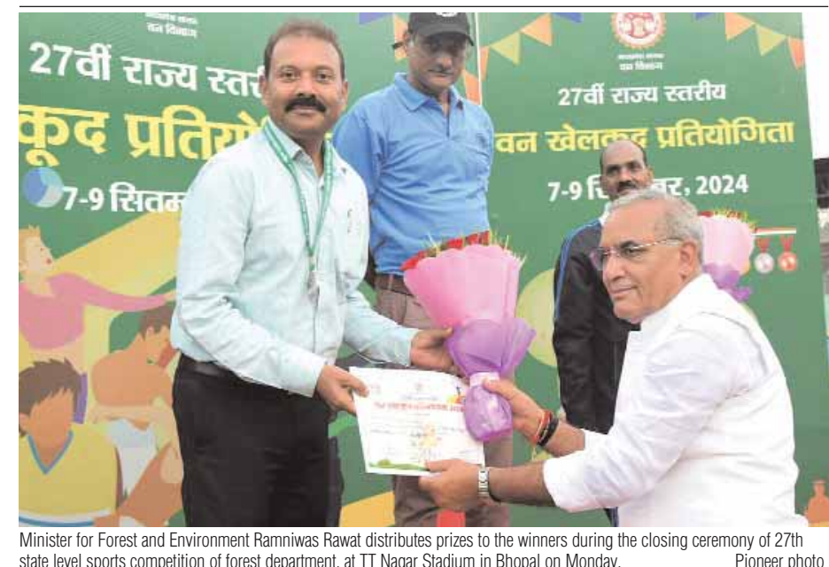
Minister for Forest and Environment Ramniwas Rawat distributes prizes to the winners during the closing ceremony of 27th state level sports competition of forest department, at TT Nagar Stadium in Bhopal on Monday.